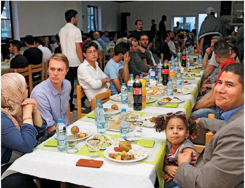
Photo: Breaking the Fast Together

Some people with a migrant background who live in Saxony for a short time, especially refugees, have a limited budget at their disposal and may struggle to live within their means. To help them manage their finances sustainably, consultation and training is now also provided to them and multipliers. This is subsidised by the state program entitled "Integrative Measures."