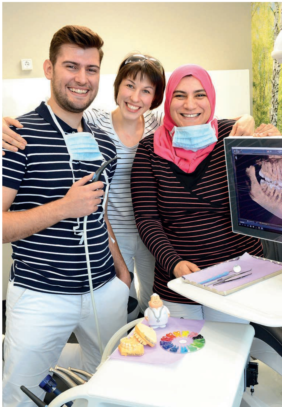
Photo: Syrian medical personnel in Dresden