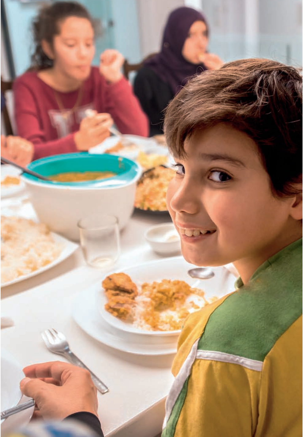
Photo: Feeling at home