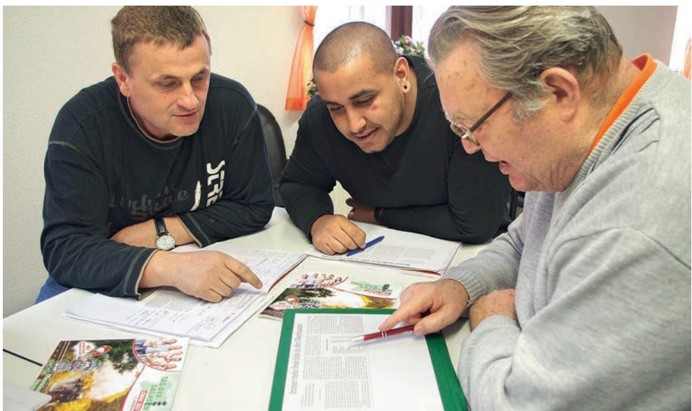
Photo: Intergenerational Learning on a Common Project